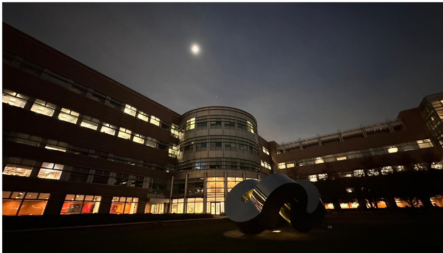
A glimpse of the Lerner Research Institute during totality.